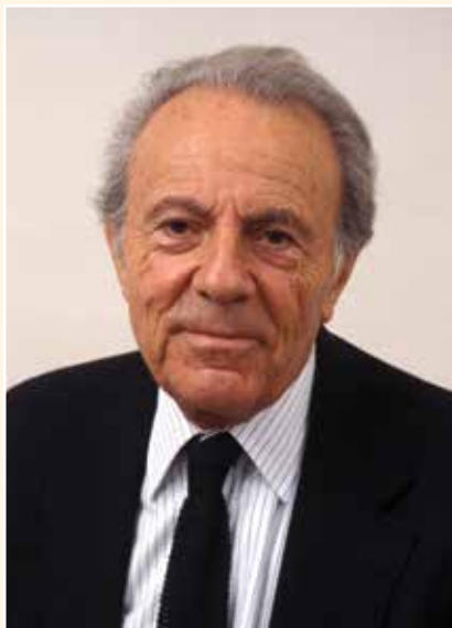
FRANCOIS JACOB (June 17, 1920 – April 19, 2013)